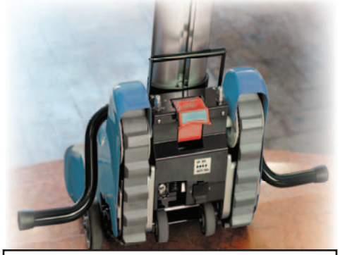
Track firmly contacts the floor and stairs without leaving marks