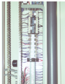
Electronic free relay logic controller